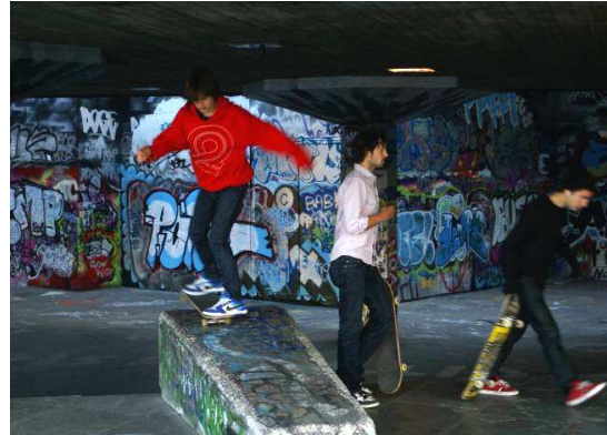
Figure 4 Skateboarding constrained under platform

However, some behaviour that might cause personal injuries, perceived threats and damages to the built environment were rigidly prohibited or merely constrained in a particular place. Skateboarders were only allowed to assemble under the platform of Queen Elizabeth Hall, which was specially designed for them (Fig. 4.). Although it had become an attraction of the South Bank, this precisely reflects the strict regulation on the usage of public space. Moreover, skateboarding, cycling and ball games were also occasionally observed occurred in the lawn terrace or the Scoop near the City Hall, but immediately interrupted and stopped by staffs from the authorities (Fig. 5. & Fig. 6.). People’s willingness of engagement was substantially oppressed by regulation and surveillance, which only left behind the seductive but desolate landscape.