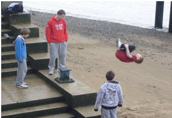
Figure 1 Teenagers practice skills of somersault

Generally, people's creative appropriation of public space for recreational purpose was widely observed. Users' desire of engagement in public space can be reflected by the increasing number of unplanned activities corresponding to the growth of the overall population. With regard to specific activities, physical features of the built environment, such as change of levels, staircase and public installations, played a crucial role in encouraging people's exploration and participation. Most sustained activities were recorded concentrated in those places. For instance, teenagers got together and exercised their skills of somersault in the stair of pier after ebb (Fig. 1.); kids stepped into the water and ran through the fountains back and forth near the City Hall (Fig. 2.); and young children climbed up and down and chased each other around the annular stone installation in the Queens' Walk (Fig. 3.). Notwithstanding the potential risks that may hurt users, people continuously appropriated those characteristic spaces. This not only mirrors their capacity of interacting with the environment but also the positive effect of taking proportionate risks in public space design.