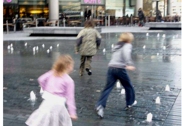
Figure 2 Young children run through fountains