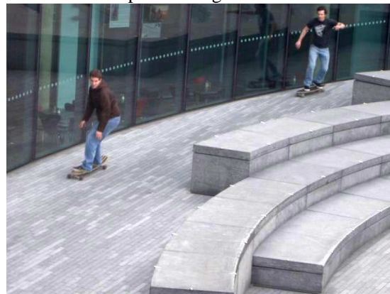
Figure 5-6 Cycling and skateboarding occasionally emerge around City Hall but are immediately interrupted