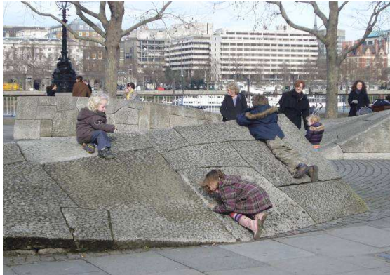
Figure 3 Kid climb and chase each other